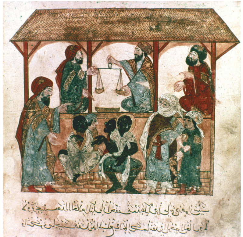
▲ An Arab slave market in Yemen, A.D. 1237

Although Muslim traders had been enslaving East Africans and selling them overseas since about the ninth century, the numbers remained small—perhaps about 1,000 a year. The trade in slaves did not increase dramatically until the 1700s. At that time, Europeans started to buy captured Africans for their colonial plantations. B